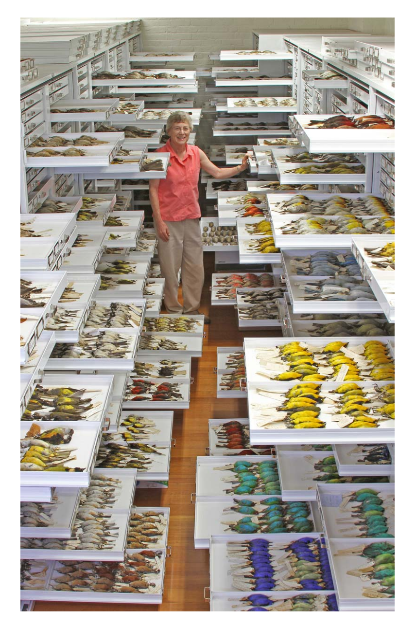
Figure 2. Natural history museum collections are tremendous repositories of specimens and data of many sorts, including phenotypes, tissue samples, vocal recordings, geographic distributions, parasites, and diet. doi:10.1371/journal.pbio.1001466.q002

widespread occurrence of lateral gene transfer. However, the phylogeny of these organisms and their genes remains critical to understanding their scope, origins, distributions, and change over time [92]. The advent of metagenomic sequencing of environmental microbial communities has revealed greater diversity and flux of genotypes than ever imagined, defying conventional species concepts and presenting a major challenge to applying traditional evolutionary and ecological theory to understanding microbial diversity